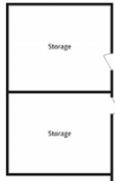
Lower Ground Level